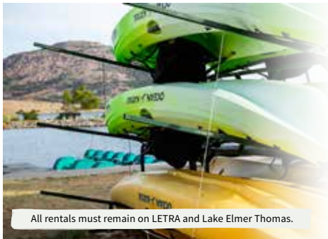
All rentals must remain on LETRA and Lake Elmer Thomas.

Lake Elmer Thomas Recreation Area has a variety of equipment available to rent and activities to enjoy. Rentals are done directly out of the LETRA Country Store year-round.