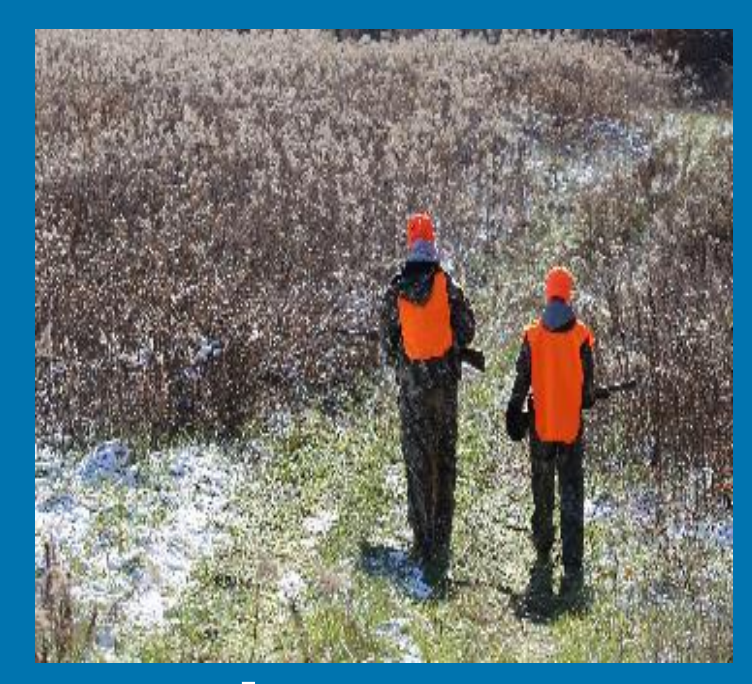
Youth Deer Hunt & Adult Safety Briefing 22 Oct 21

Eligible Youth under 18; adult must be over 21