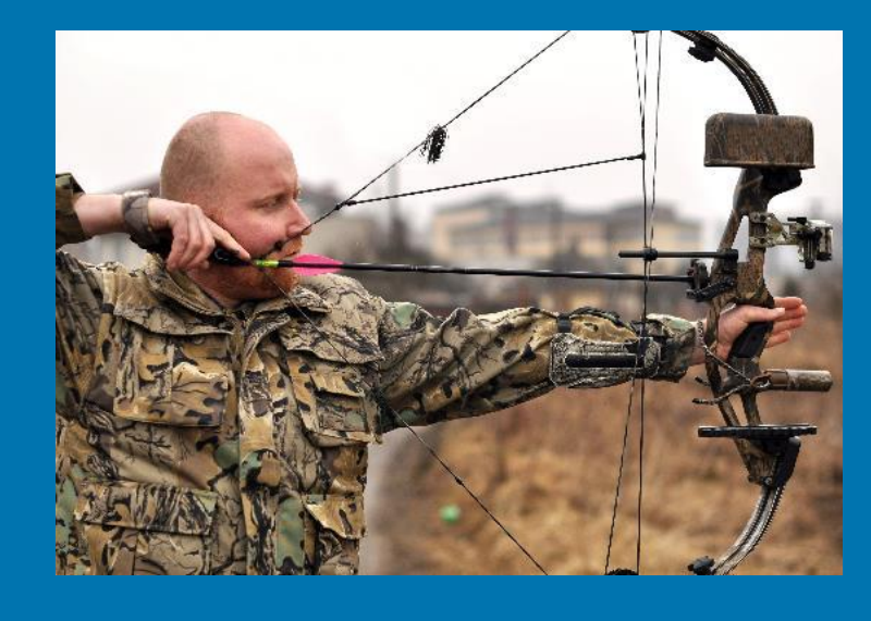
Deer Hunt Archery Opening Day 9 Oct 21

Eligible Youth under 18; adult must be over 21