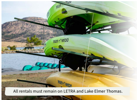
All rentals must remain on LETRA and Lake Elmer Thomas.

Lake Elmer Thomas Recreation Area has a variety of equipment available to rent and activities to enjoy. Rentals are done directly out of the LETRA Country Store year-round.