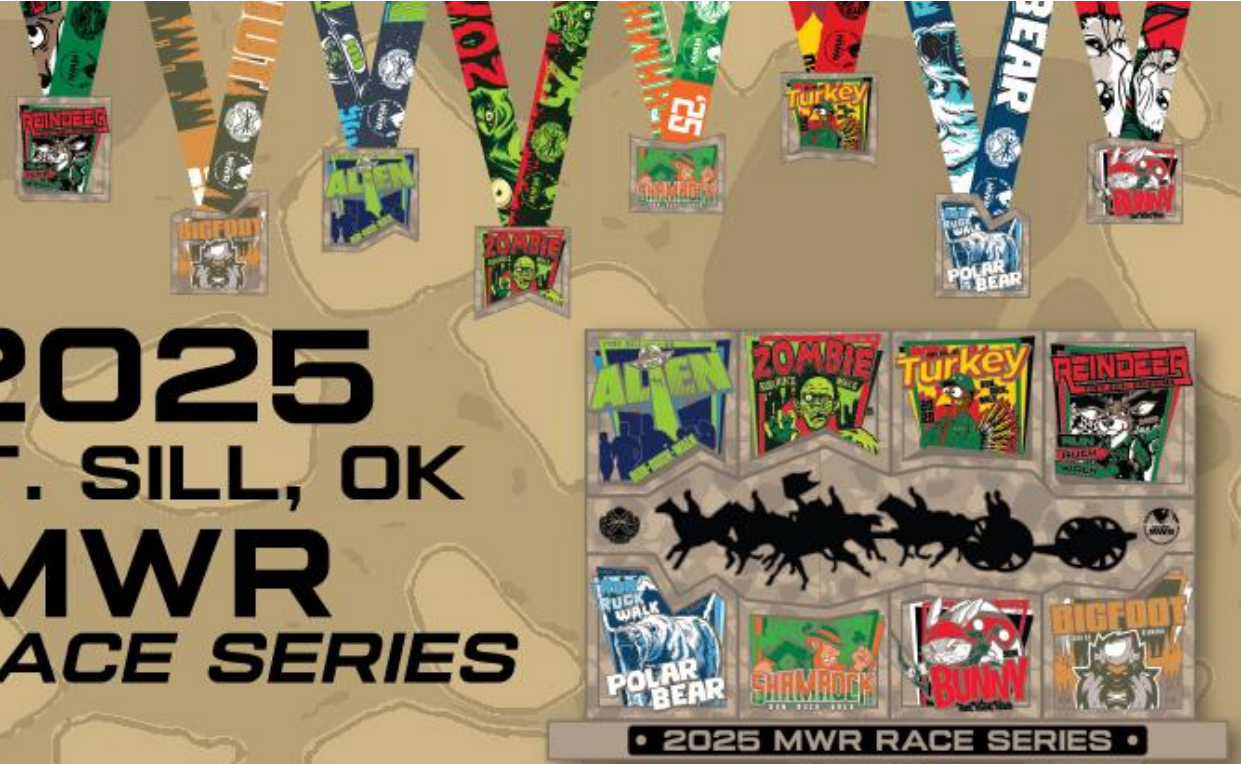
• 2025 MWR RACE SERIES •

ALIEN 8K - 16 AUG ZOMBIE- 25 OCT TURKEY- 15 NOV REINDEER- 13 DEC